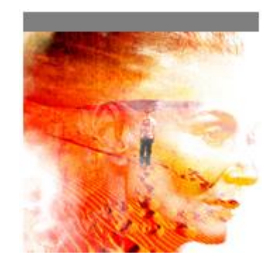
Sugar and Snails